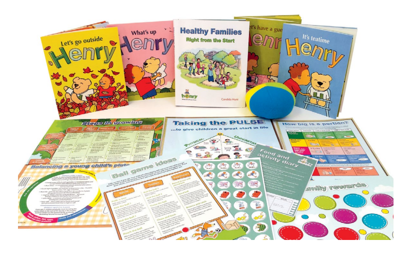
The HENRY Parent Toolkit - free to everyone joining a HENRY programme

The HENRY toolkit will help you give your child a great start in life, get the whole family involved, and keep track of how well you're doing.