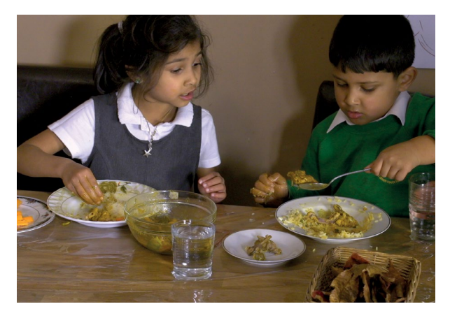
Charity number 1132581 | Company number 6952404